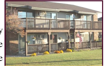
Autumn Valley Senior Housing

If you would like information or an application for senior housing, call (815) 469-4907.