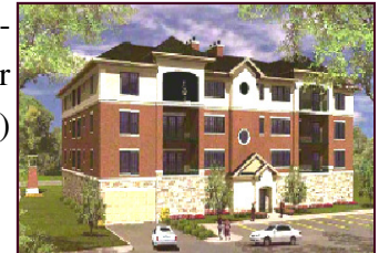
Landings Pointe Senior Housing