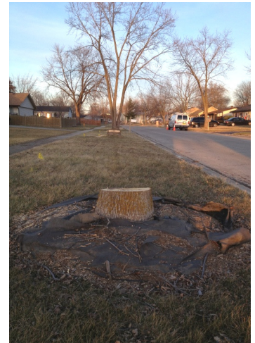
An ash tree stump in the Arbury Hills neighborhood.

Signs will be posted announcing exactly when the work will begin. Residents are asked not to park in the street from 7 a.m. to 5 p.m. while the trees are being removed.